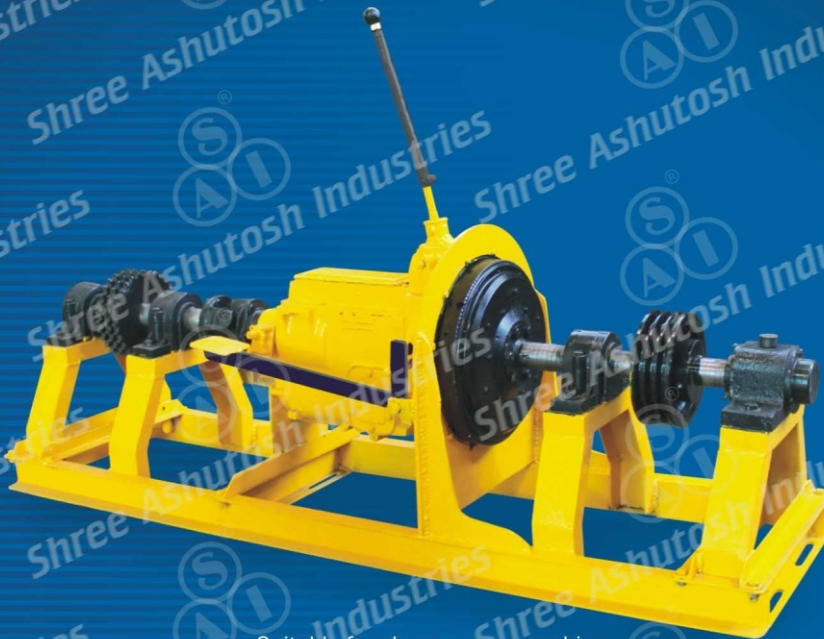
Suitable for above runner machine